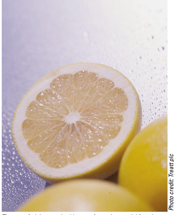
The grapefruit is comprised in part of genetic material from its older descendant, the pummelo.

Today's grapefruit may in fact be an accidental hybridization between the pummelo and the orange, combining the sweet flavor of the orange with the tangy