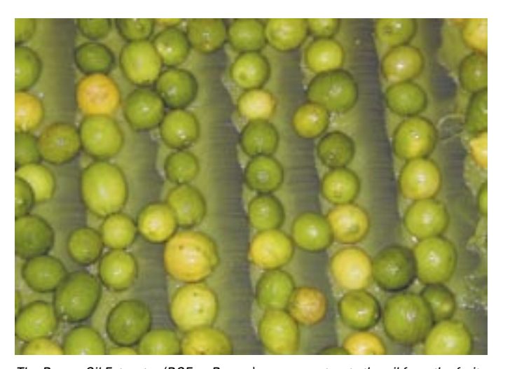
The Brown Oil Extractor (BOE or Brown) process extracts the oil from the fruit first by gently puncturing the flavedo, or peel, of the fruit with thousands of stainless steel needle points.