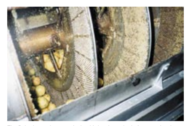
The Pelatrice-style rasper is the third main method of processing, in which the fruit is subjected to rolling disc graters that allow the flavedo to be rasped.

the fruit is subjected to rolling disc graters that allow the flavedo to be rasped. The oil is then captured in a water spray and piped away for centrifuging and polishing. After the oil has been extracted, the fruit, by now largely flavedo free, is further processed for juice using specialist equipment.