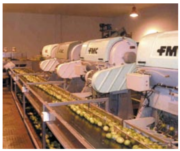
The FMC-type extractor is the most common method used to extract the oil and juice from the lemon.